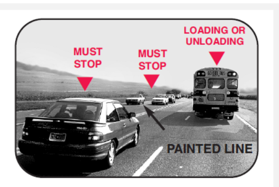
You MUST STOP on roadways with painted lines.